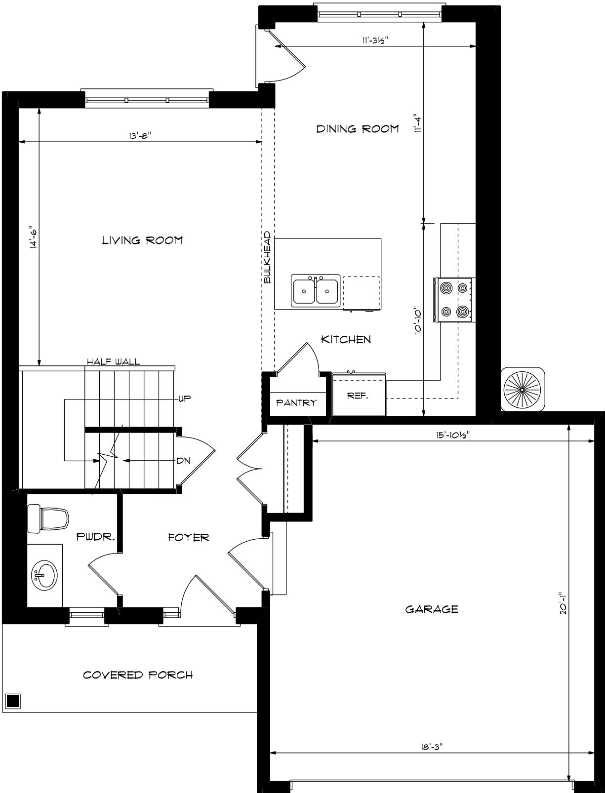
MAIN FLOOR PLAN 710 SQ.FT.